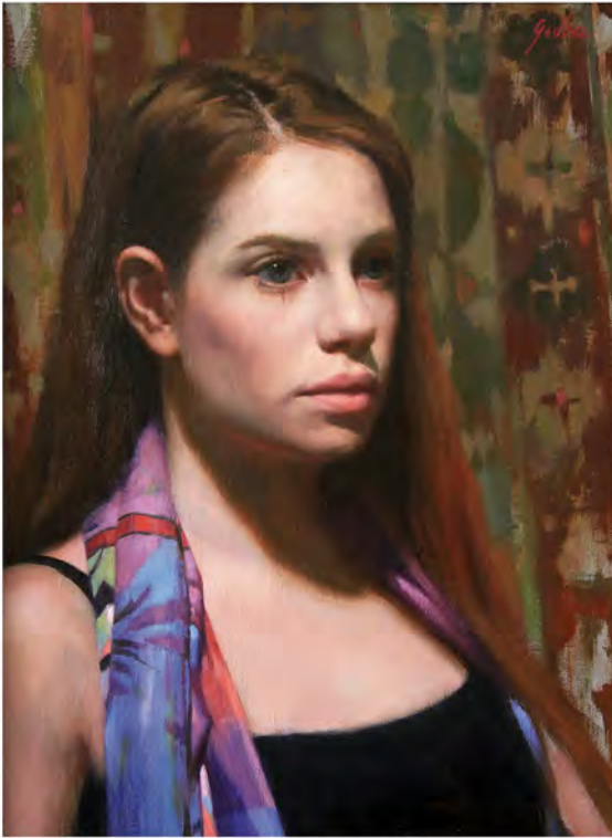
Gloria with a Scarf oil on linen, 16 x 12"