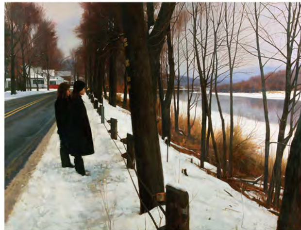
Winter View of the Delaware River, oil on canvas, 36 x 48"