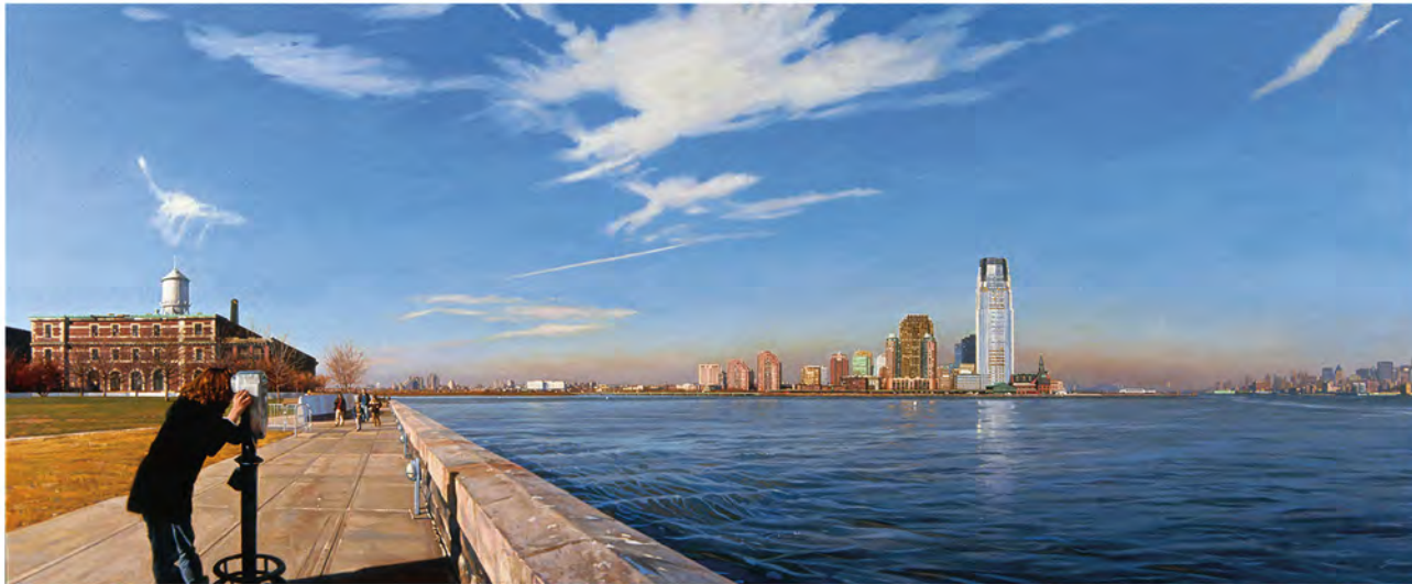
Jersey City from Ellis Island, oil on linen, 24x60"