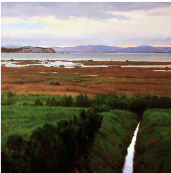
View of St. Lawrence River oil on linen, 36 x 36"