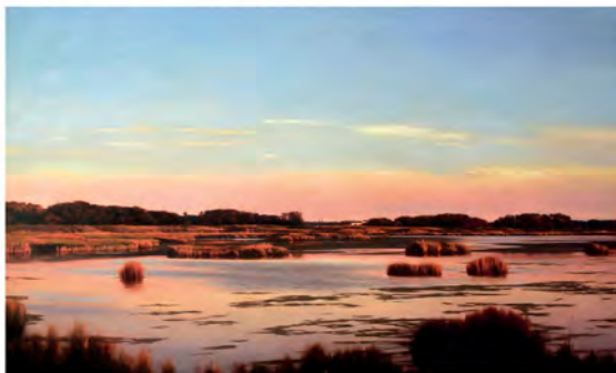
Cape May Marshes at Sunset, oil on linen, 36 x 60"