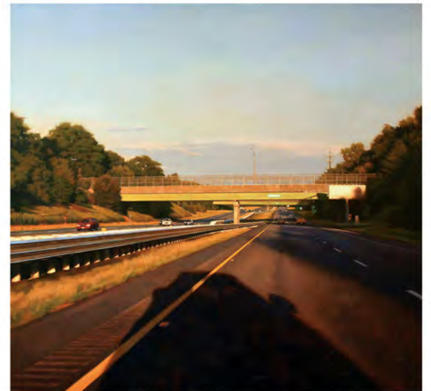
Route #24 Overpass - oil on linen, 40 x 40"